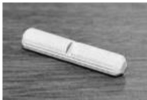
Figure 1 Dowel rod with slit