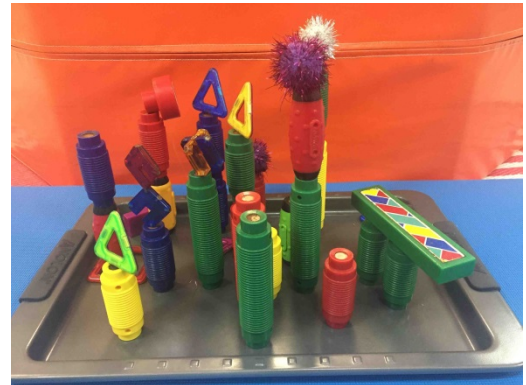
Figure 4 Magnetism Board