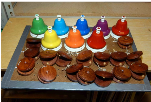
Figure 2 Bell Board