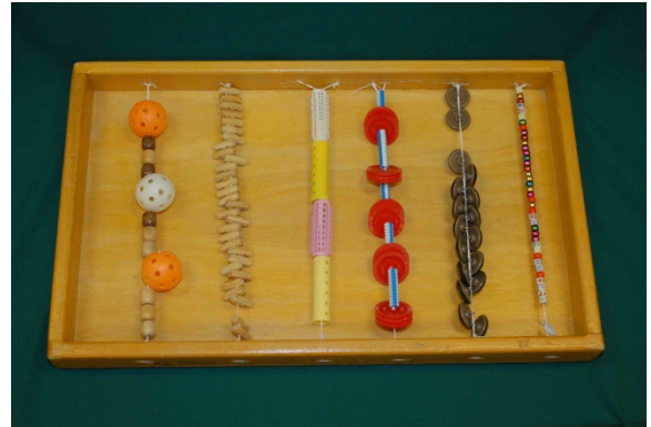
Figure 1 Elastic Board