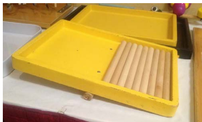
Figure 3 Tipping Tray